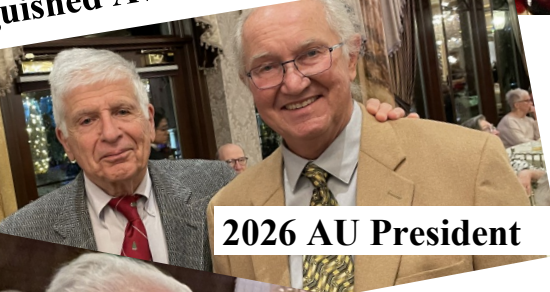
2026 AU President